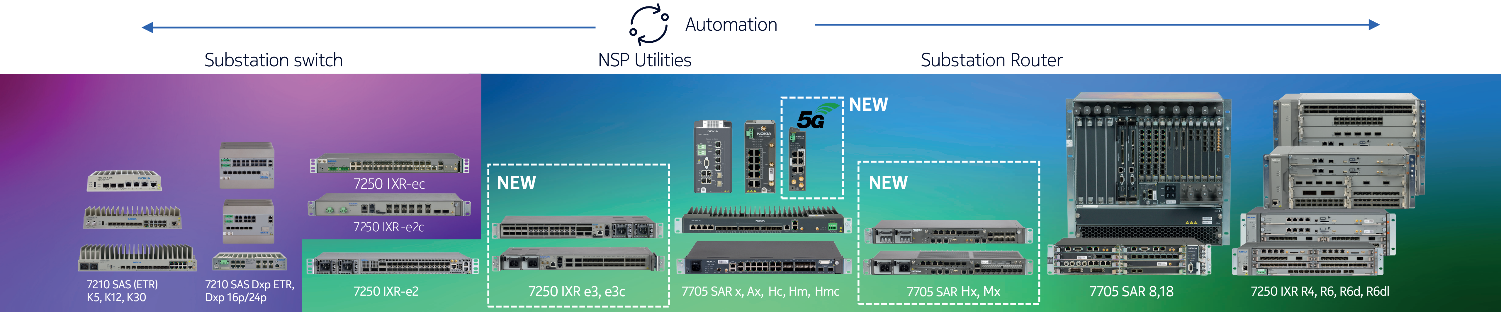
Figure 1: Extending the Nokia IP routing portfolio for utilities

These platforms are designed to deliver best-in-class capabilities and longevity with a network processor-based architecture that features a completely programmable data path. They leverage the feature-richness of our SR OS, which is built to power the most demanding and dynamic Ethernet and IP/MPLS networks. Their design ensures scalable and secure network connectivity. The SAR-Hx and SAR-Mx platforms offer robust timing capabilities with a built-in GNSS receiver that enables accurate phase, synchronization and time distribution.